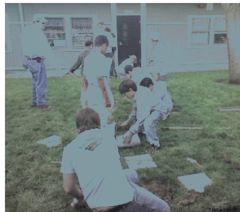
Scouts work on last years project.

Both of these events will count for service hours. More information and the permission slips will be available in the near future.