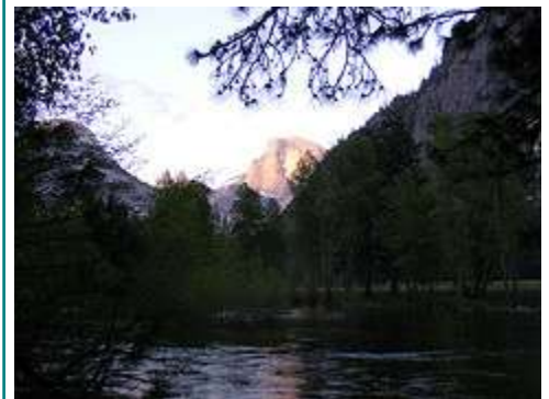
As evening falls on Half Dome