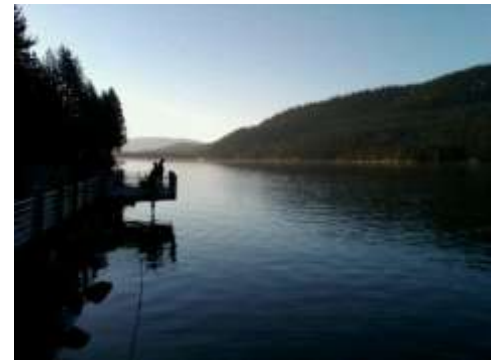
Early morning fishing